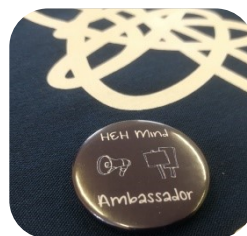
An Ambassador badge

Generally you will be an approachable club member who champions the fact that you don't need to be an expert to support better health & wellbeing.